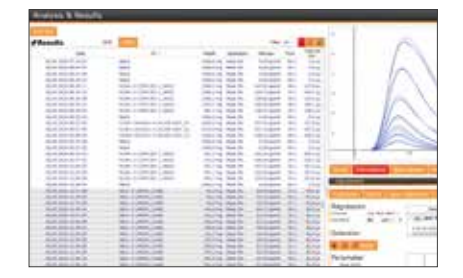
Analysis results after 120-180 seconds