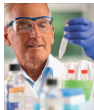
Pharmaceutical and chemical industry