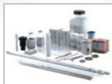
Long-life VELP Consumables

Flexibility Choose between NDA 701 and NDA 702, for a customized solution.