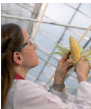
Food, feed and beverage industry

The NDA is extremely versatile, being suitable for nitrogen and protein determination in several kinds of sample, in accordance with official AOAC, AACC, ASBC, ISO and OIV methods.