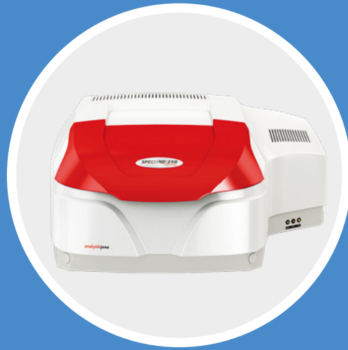
Analytik Jena spectrophotometer for DT Online UV/Vis System