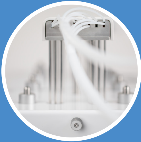
Automated sampling station ASS-9