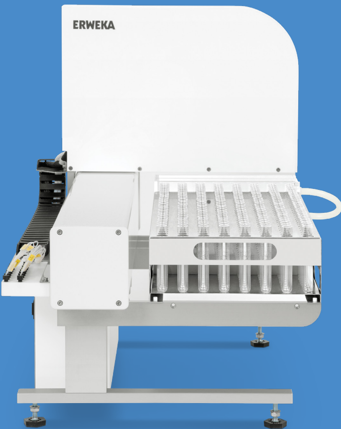
Sample collector FRL

Thanks to the upgradeability features of the DT 950, every DT 950 can be upgraded to a digital offline system.