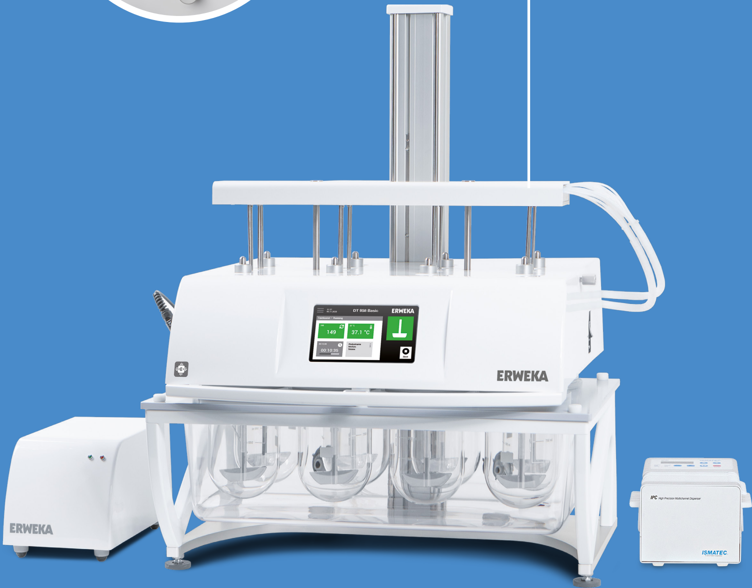
DT 950 Series with up to 8 test stations