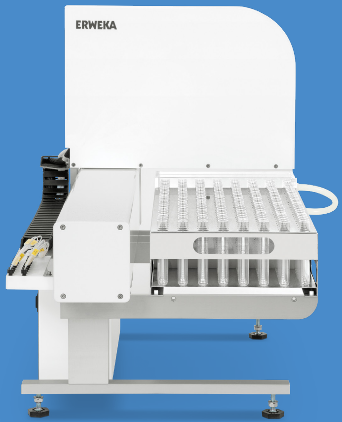
Sample collector FRL