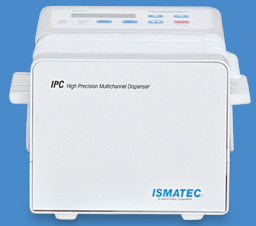
IPC 16 pump