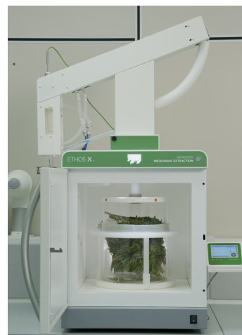
Figure 2. ETHOS X 2.0

ETHOS X 2.0: Up to 2.5kg of fresh-frozen cannabis material was placed in a mixing container. The cannabis buds were mixed with 1.25L of distilled water for 10 minutes (1:0.5, material:water ratio). The mixture was then transferred into the 15L reactor glass vessel and placed inside the X 2.0 cavity. After the desired pre-uploaded method was selected, the extraction process started.