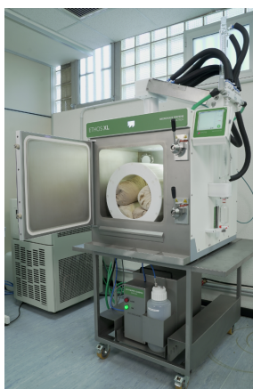
Figure 1. ETHOS XL

ETHOS XL: Up to 10 kg of fresh-frozen cannabis material was loaded into material socks (approximately 2.5 kg of material per material sock). The material socks were sealed and placed inside the ETHOS XL cavity. After the pre-loaded method "full load" was selected, approximately 9L of water filled the cavity and the extraction process began.