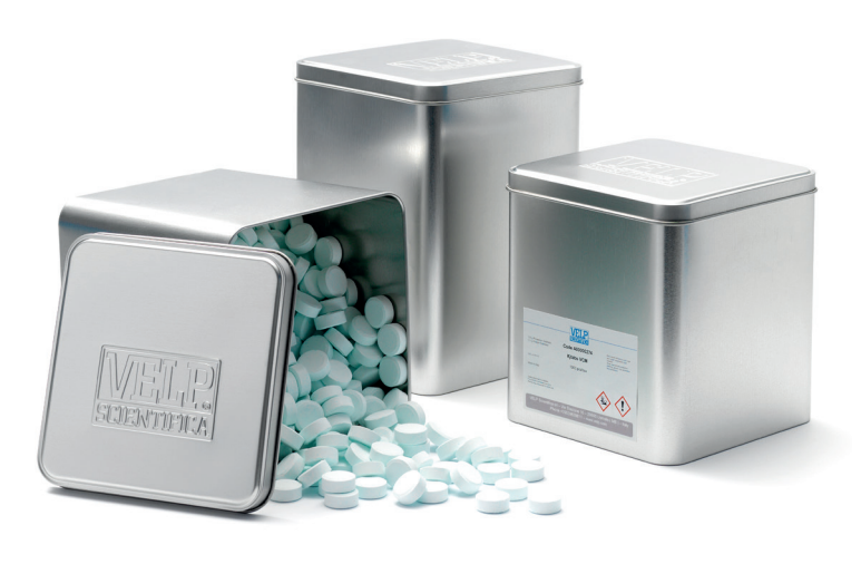
Use Genuine VELP consumables and accessories to get the best performance from your DKL