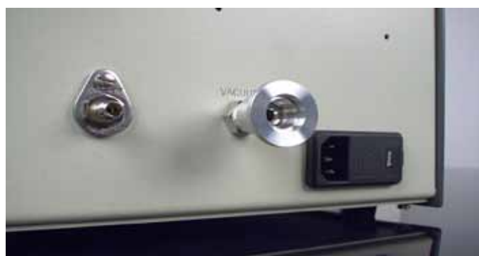
Gas Input and Vacuum Fittings