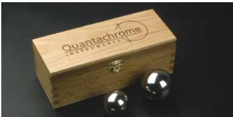
NIST traceable calibration spheres.