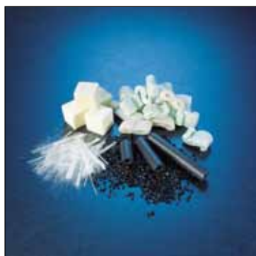
Foams and Fibers