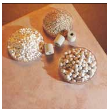
Catalysts and Ceramics