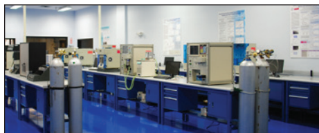
Quantachrome Instruments Application Laboratory.

Quantachrome is also recognized as an excellent resource for authoritative analysis of your samples in our fully equipped, state-of-the-art powder characterization laboratory.